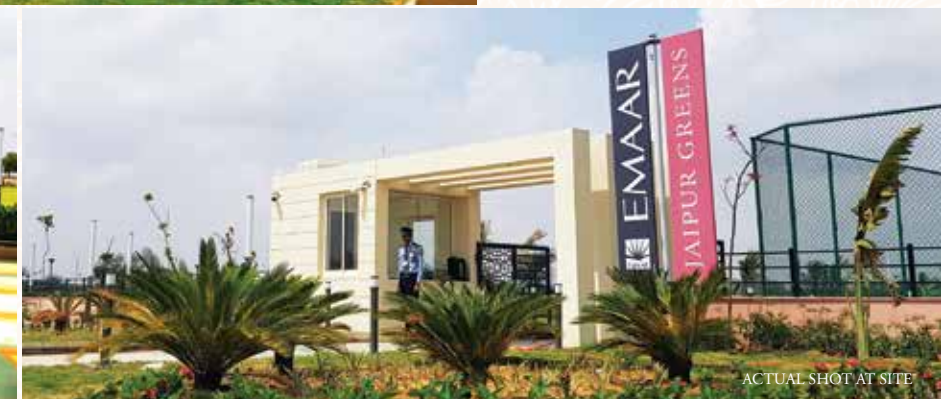
ACTUAL SHOT AT SITE

The Vaikunth Villa Plots at Jaipur Greens is a part of 155 acre residential township with a 7.2 kilometer long boundary wall for an enclosed secure environment. With large natural green areas, landscaped zones and water bodies, this self-sustaining modern township keeps the Rajasthani traditions alive.