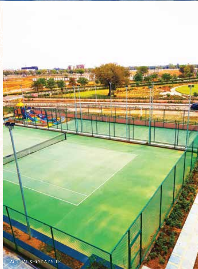
ACTUAL SHOT AT SITE

Rain water harvesting and sound irrigation system.