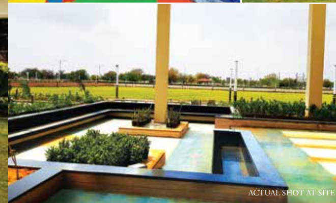
ACTUAL SHOT AT SITE