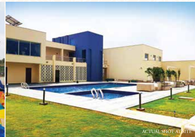
ACTUAL SHOT AT SITE