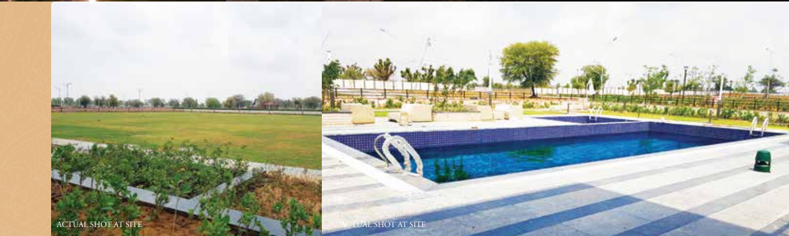
ACTUAL SHOT AT SITE