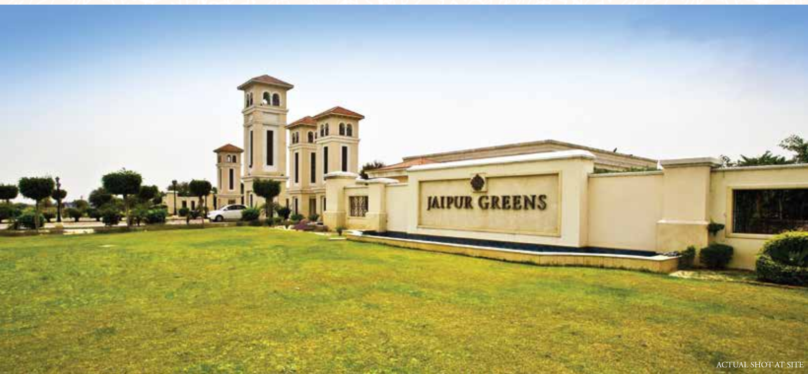
ACTUAL SHOT AT SITE