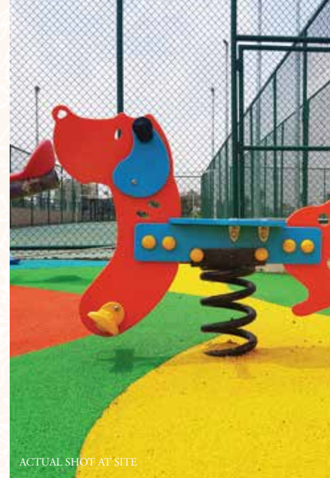
ACTUAL SHOT AT SITE

Exclusive swimming pool Two badminton courts One outdoor tennis court Well equipped, modern and airconditioned gymnasium Dedicated yoga room Many more indoor games