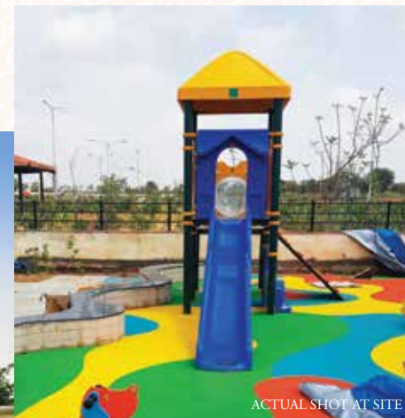
ACTUAL SHOT AT SITE