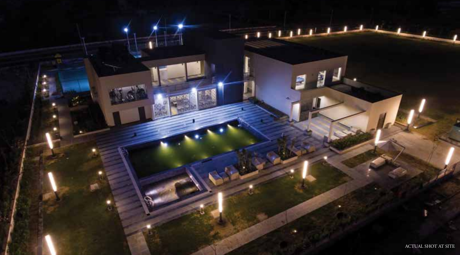
ACTUAL SHOT AT SITE